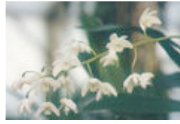
Dendrobium x delicatum (a natural hybrid)