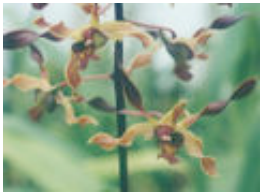
Dendrobium Mini Brown (a man-made hybrid)