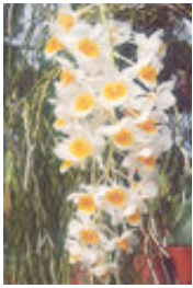
Dendrobium densiflorum x farmeri pink (a hybrid)