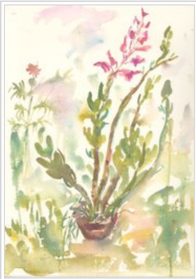
Painting of a typical Dendrobium , by I. V. Passmoore; probably the hybrid Dendrobium Lucky Seven

Dendrobium Swartz is a large genus of tropical orchids that consists of about 1200 species. The genus occurs in diverse habitats throughout Asia, the Philippines, Borneo, Australia, New Guinea and New Zealand. The name is from the Greek dendron (meaning tree) and bios (meaning life).