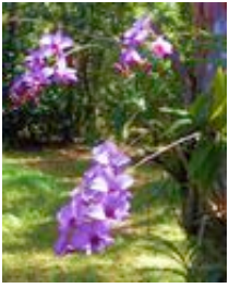
Cooktown orchids Dendrobium biggibum